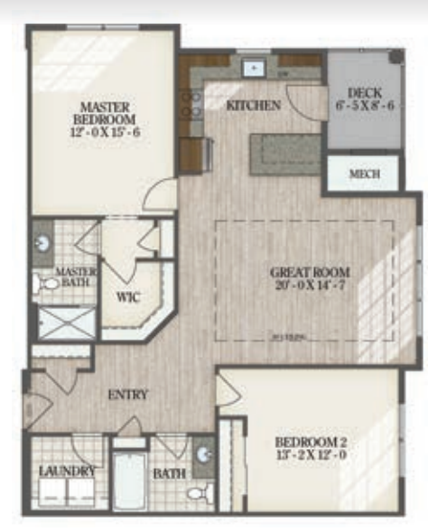
Typical Two Bedroom